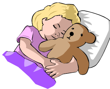
I love naps.

important point: Quality naps can make up for lost night sleep-but extra nighttime sleep does not make up for missed naps. Therefore, no matter how a child sleeps at night,-great sleeper or poor sleeper-his daily naps are critically important to release the rising sleep pressure and maintain his happy mood.