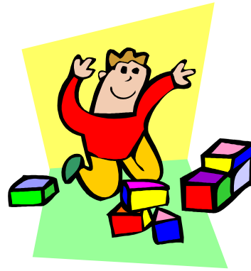
Pretend I'm making a parking garage. You bring the cars.

guided by the basic principles of play. Make-believe isn't as stimulating and satisfying if players don't stick to their rules. When children follow the rules of make-believe and push one another to follow those rules, they develop important habits of self control.